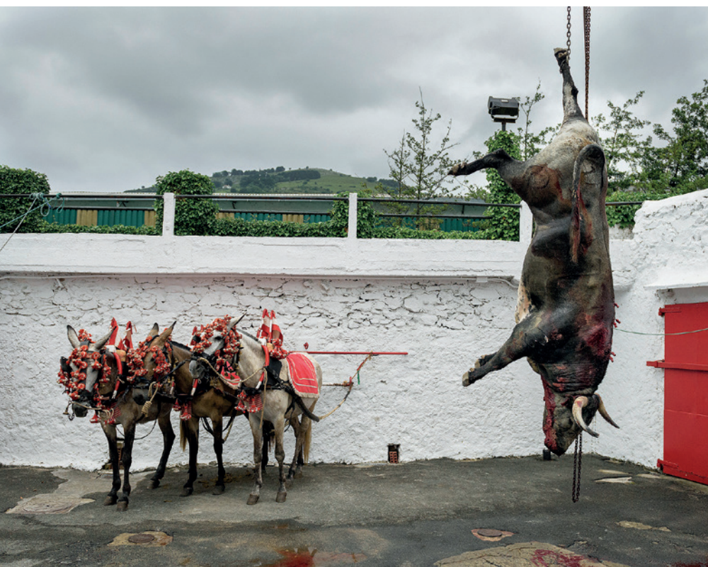
■ Inglorious death. In the horse yard of the bullring in Azpeitia, a bull is hung by his hind leg to bleed out before being butchered at the local meat works. Spain.