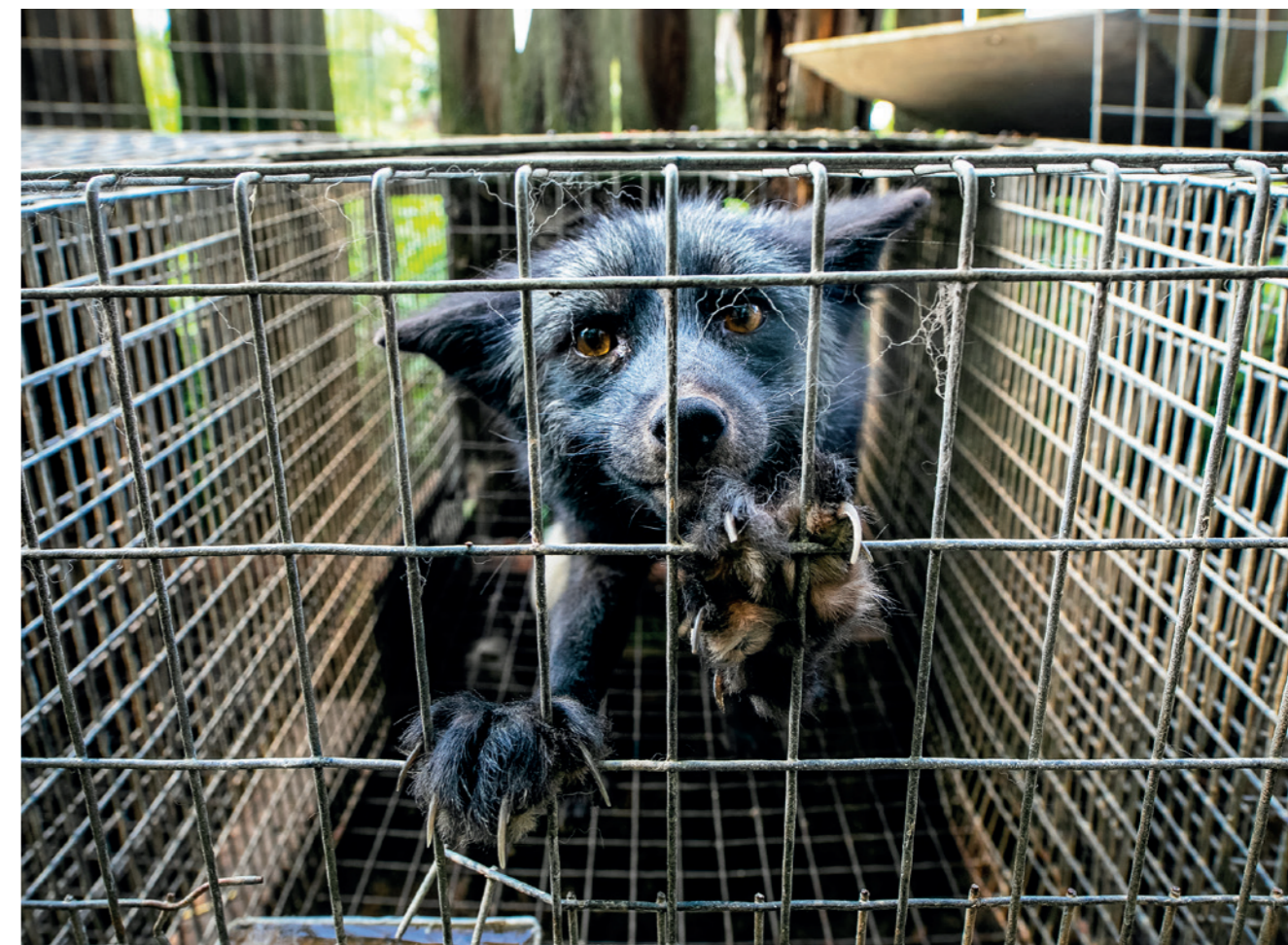
■ A caged fox on a fur farm in Poland, the world's third largest fur producer. The country recently voted to ban fur farming from 2021.