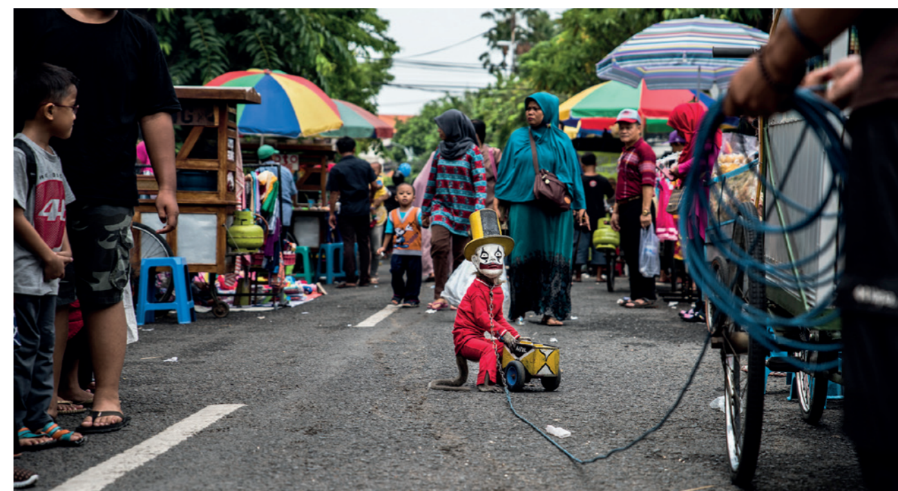
■ A macaque performs in a popular street show in Jakarta, known locally as Topeng Monyet (Mask Monkey). Indonesia. JOAN DE LA MALLA