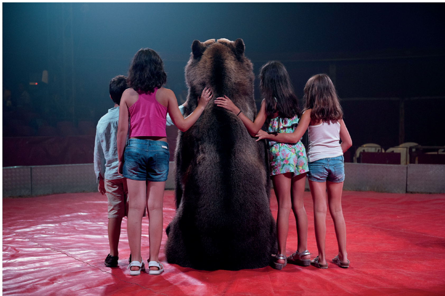
■ Tima the brown bear of the Gran Circo Holiday circus poses for a photo with children in Spain. AITOR GARMENDIA