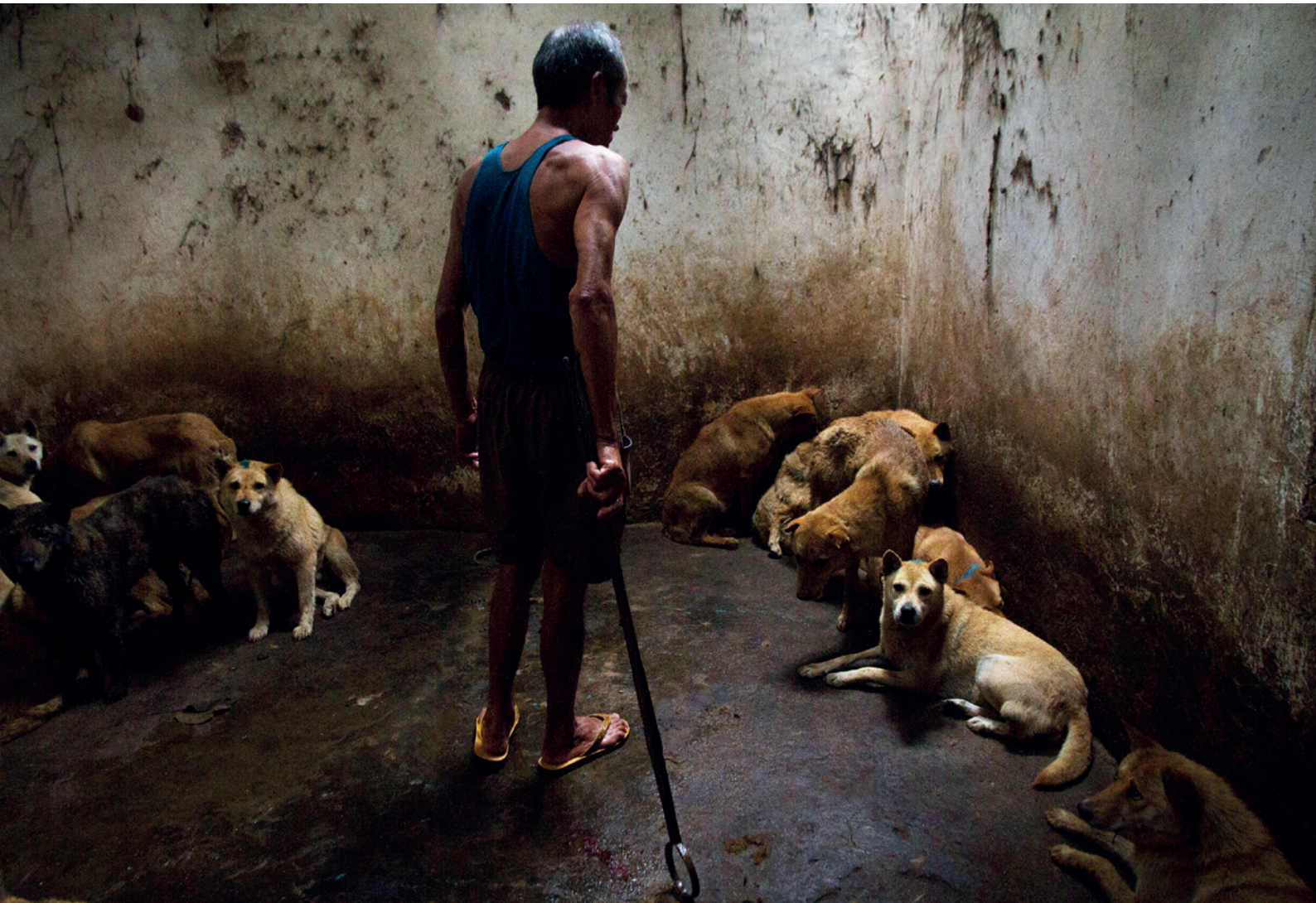
■ Who's next? At this dog slaughterhouse, a butcher chooses the dog he will beat to death with an iron bar while the other dogs look on. China. JOSE VALLE